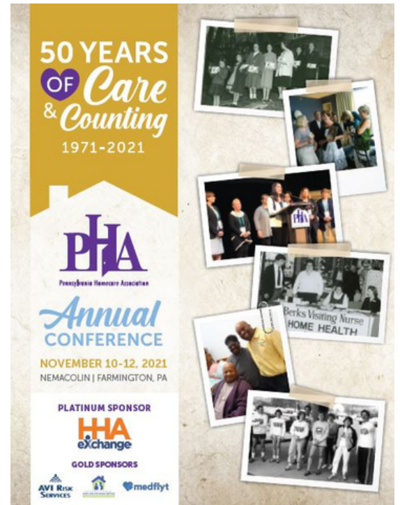
2021 PROGRAM COVER