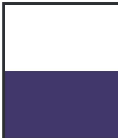
Half-Page 7.5" x 4.75"